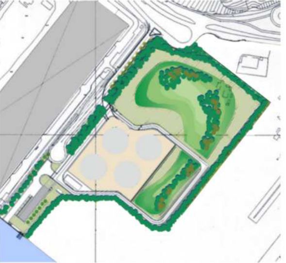
Landscape Master Plan (At Day 1 (2005), with Mitigation Measures)

Buffer Planting LMM2 (of fast growing Casuarina species, planted as heavy standards and whips and at close centres)