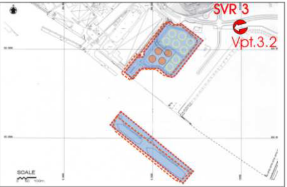
Photomontage Viewpoint Location